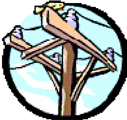
City Superintendent Jeff Robinson

July and August have been pretty busy in the Public Works Department. Crack sealing has been completed on Campbell Drive, Lincoln Street, Eder Street, and Westwood Avenue. Seal coating has been completed on Mechanic Street and in the swimming pool, city hall, and civic center parking lots. The 6" water main loop was also completed in July!