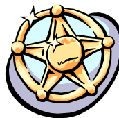
Police Chief Bob Pope

The next sTEP wave will be in force August 17th through September 3rd. The sTEP slogan is "Over the Limit. Under Arrest." During the July 2-6, 2007 sTEP wave, participating agencies reported 285 contacts with alcohol/drug-impaired drivers, 1,473 safety belt violations, 3,797 speeding violations, 308 stop sign/traffic signal violations and a total of 10,242 enforcement contacts. The participating officers assisted 707 motorists and apprehended 145