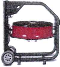
For attic attacks