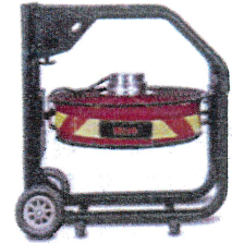
For manhole attacks