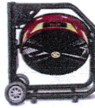
For negative tilt attacks